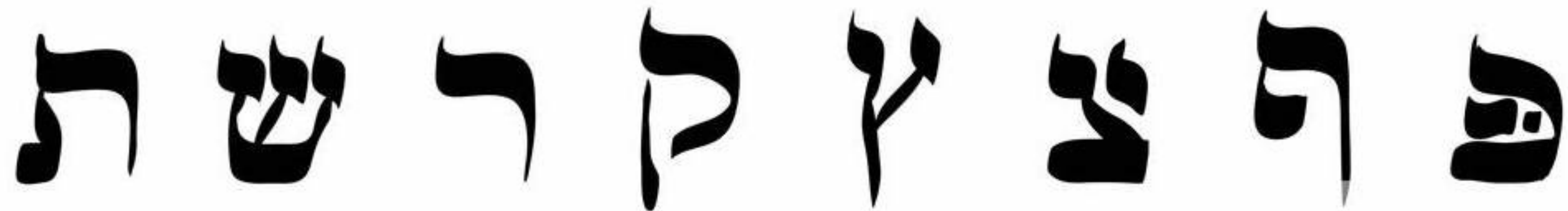
Tav Shin Resh Qof Tsadeh Tsadeh Feh Peh