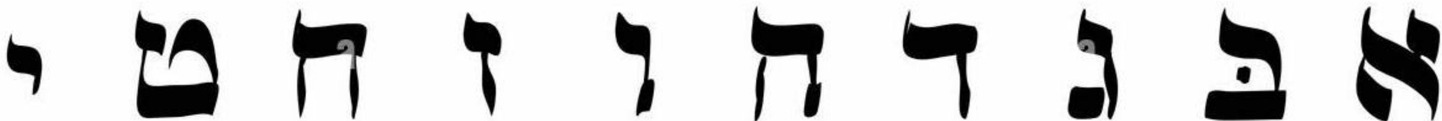
Yod Tet Chet Zayin Vav He Dalet Gimel Bet Alef