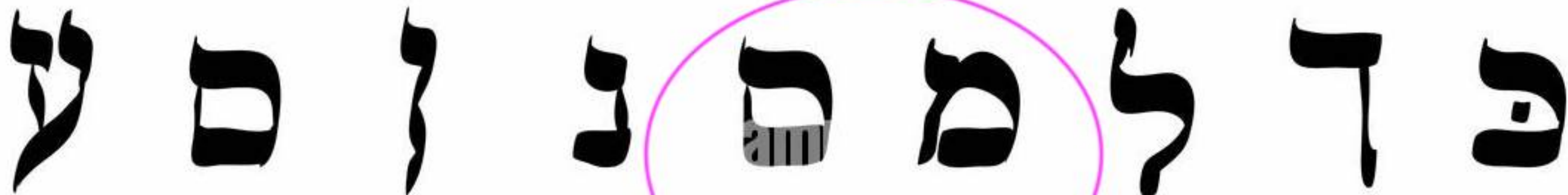
Ayin Samech Nun Nun Mem Mem Lamed Khaf Kaf